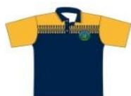
MOUNT LOFTY RANGERS 4WD CLUB SUB POLO