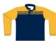
MOUNT LOFTY RANGERS 4WD CLUB LONG SLEEVE SUB POLO