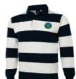
MOUNT LOFTY RANGERS 4WD CLUB RUGBY TOP 2