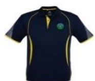
MOUNT LOFTY RANGERS 4WD CLUB POLO