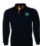
MOUNT LOFTY RANGERS 4WD CLUB RUGBY TOP 1