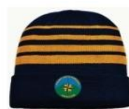
MOUNT LOFTY RANGERS 4WD CLUB BEANIE