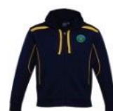
MOUNT LOFTY RANGERS 4WD CLUB HOODED JACKET