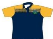
MOUNT LOFTY RANGERS 4WD CLUB WOMENS SUB POLO