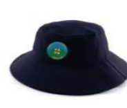
MOUNT LOFTY RANGERS 4WD CLUB BUCKET HAT