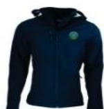
MOUNT LOFTY RANGERS 4WD CLUB SOFTSHELL JACKET