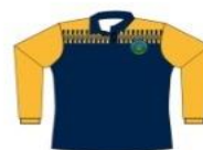
MOUNT LOFTY RANGERS 4WD CLUB WOMENS LONG SLEEVE SUB POLO