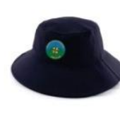
MOUNT LOFTY RANGERS 4WD CLUB BUCKET HAT