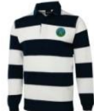
MOUNT LOFTY RANGERS 4WD CLUB RUGBY TOP 2