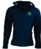
MOUNT LOFTY RANGERS 4WD CLUB SOFTSHELL JACKET