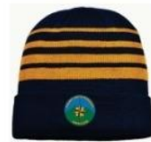
MOUNT LOFTY RANGERS 4WD CLUB BEANIE