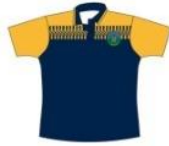
MOUNT LOFTY RANGERS 4WD CLUB WOMENS SUB POLO