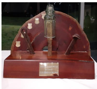
Club Person of the Year