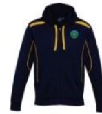
MOUNT LOFTY RANGERS 4WD CLUB HOODED JACKET