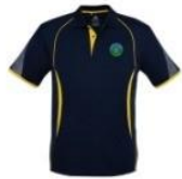
MOUNT LOFTY RANGERS 4WD CLUB POLO