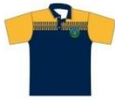
MOUNT LOFTY RANGERS 4WD CLUB SUB POLO