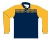
MOUNT LOFTY RANGERS 4WD CLUB LONG SLEEVE SUB POLO