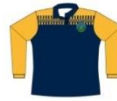
MOUNT LOFTY RANGERS 4WD CLUB WOMENS LONG SLEEVE SUB POLO