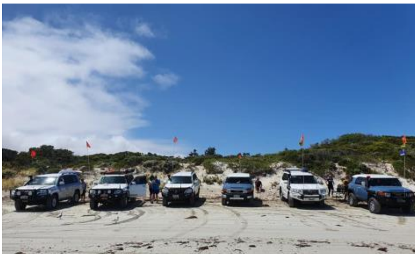
Rangers do lunch on the beach at Nora Creina