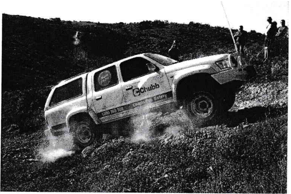
Some of the tracks up Mt Laura proved interesting.