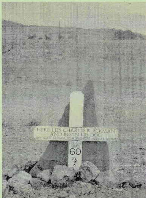
Bendleby Ranges 2005