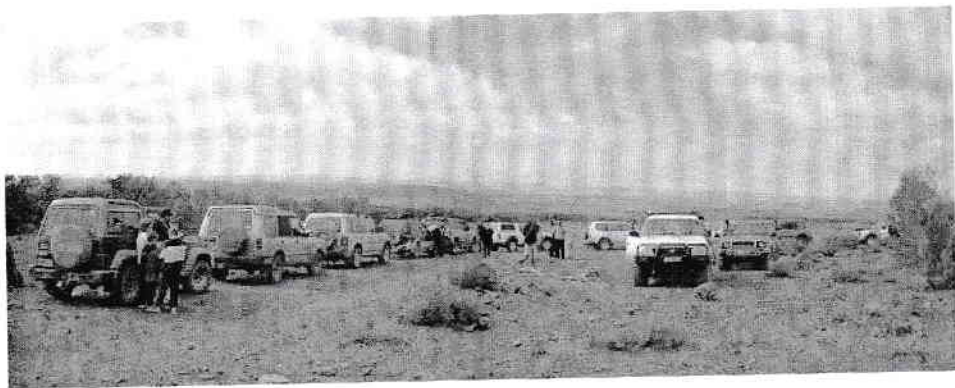
North Fence Corner from the Bendleby trip