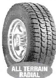
ALL TERRAIN RADIAL