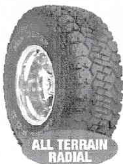
ALL TERRAIN RADIAL