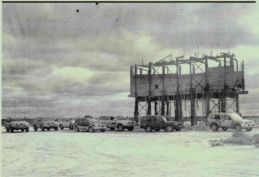
Sunset National Park – Gypsum Hopper.