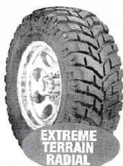
EXTREME TERRAIN RADIAL