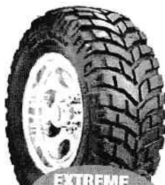
EXTREME TERRAIN RADIAL