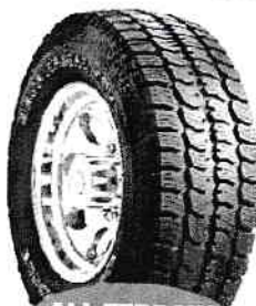
ALL TERRAIN RADIAL