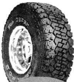
ALL TERRAIN RADIAL