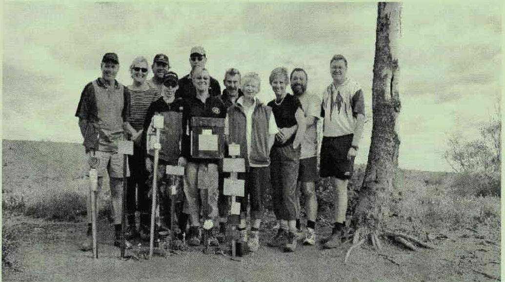
Madigan Blaze Tree—Hay River Simpson Desert