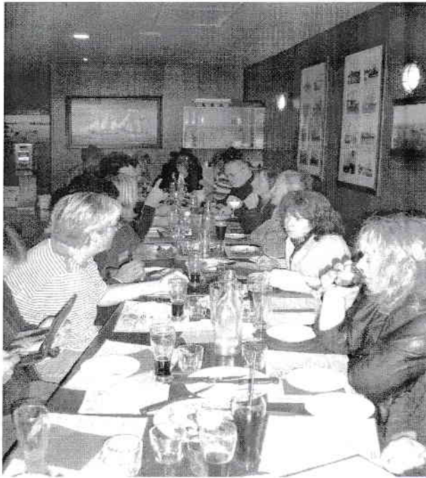
Photo from Spooks and Ghouls Night