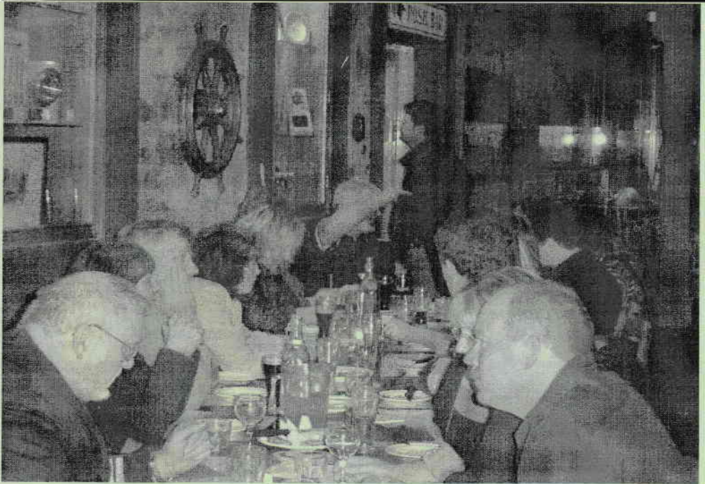
Spooks & Ghouls Night