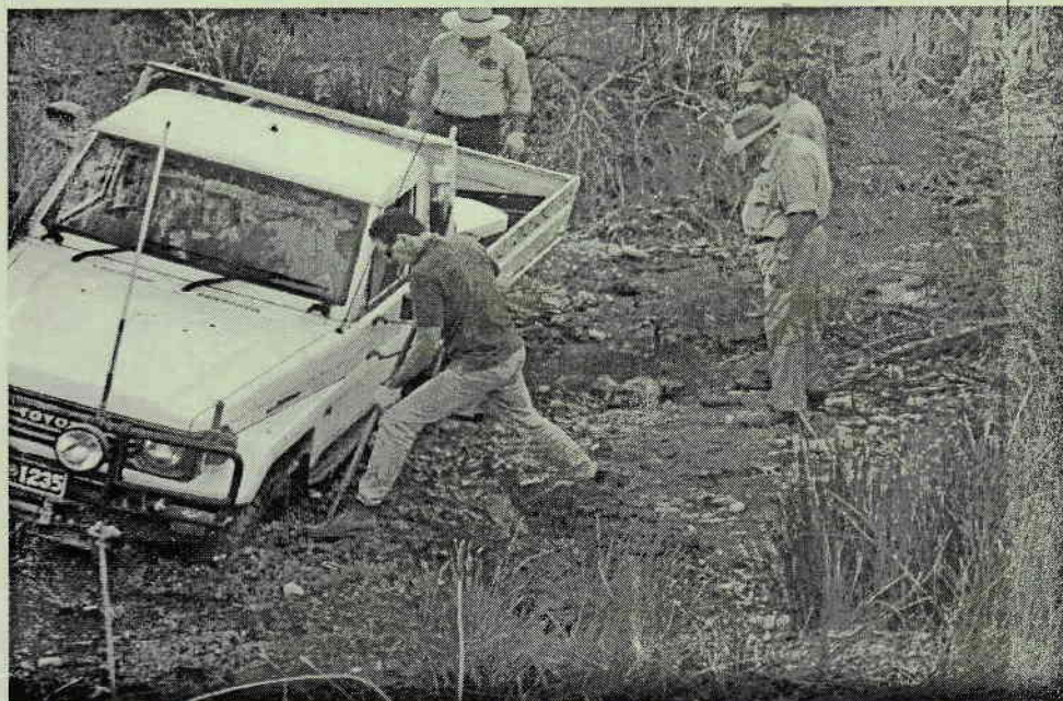
Real Recovery Training – Warren Gorge