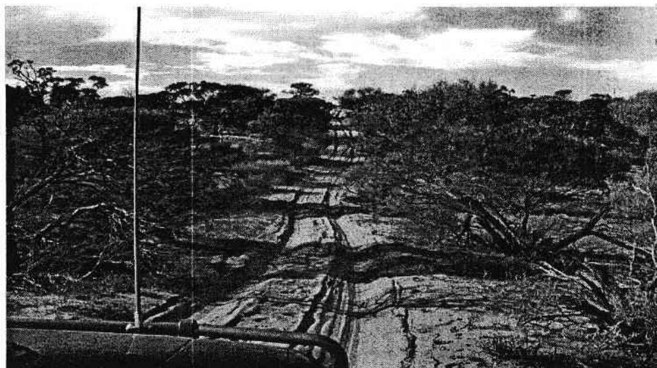
Googs Track —one of many Dunes

The birthday list will be updated soon to reflect new members.