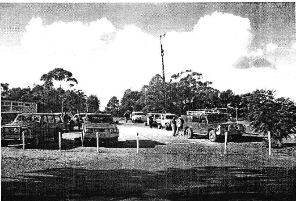
Lunch — Kapunda Oval