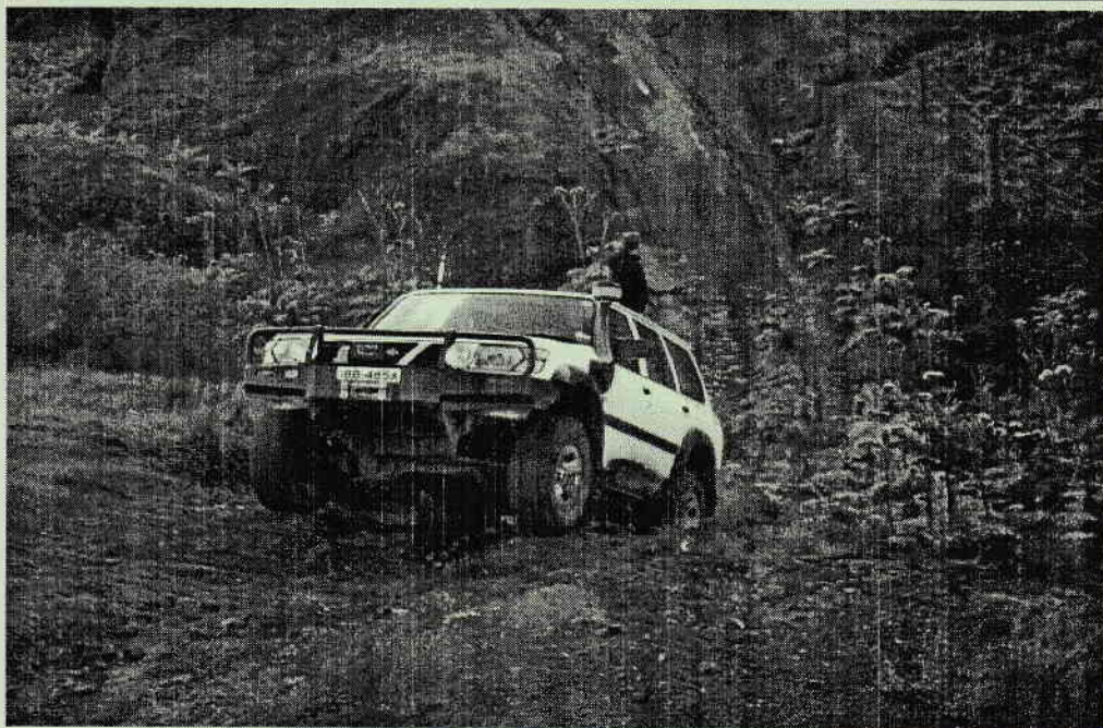
CROSSING SMALL CREEK BED—KAPUNDA DAY TRIP