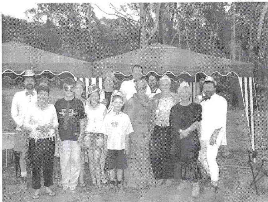
New Years Eve — Alpine Style