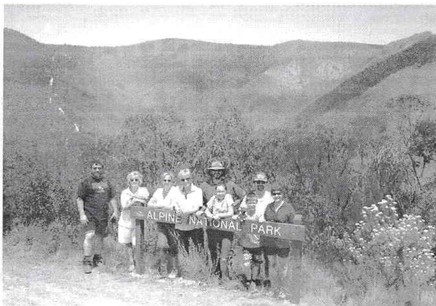
Sights found along the Billy Goat Track