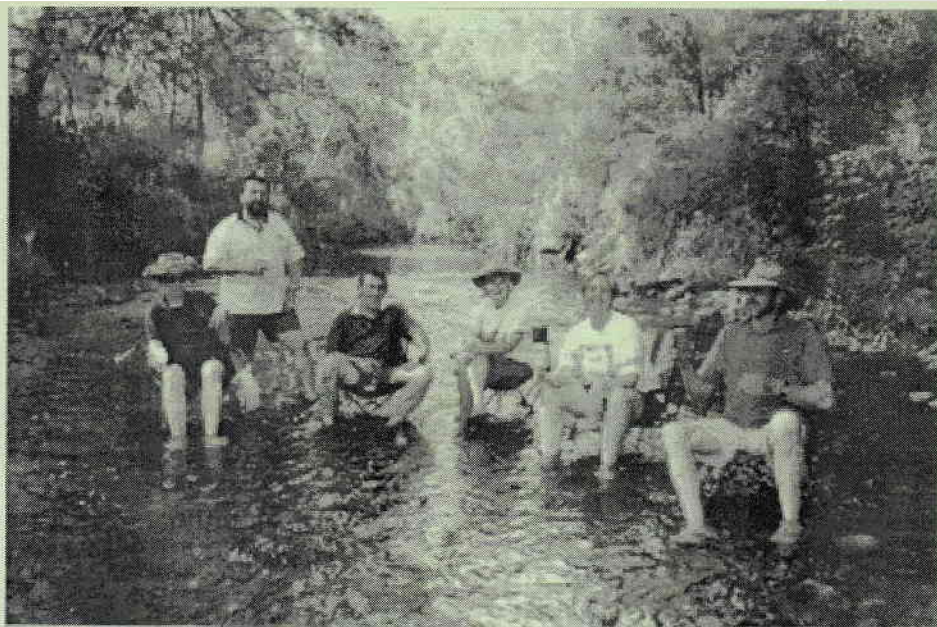
Happy Hour—Alpine style