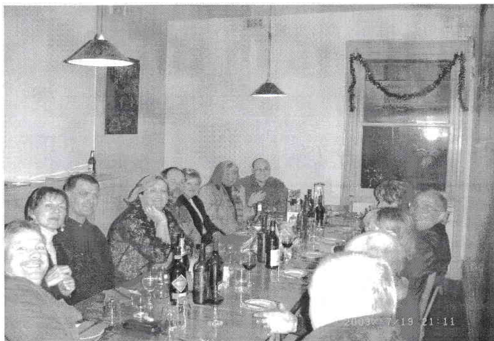
MID YEAR DINNER