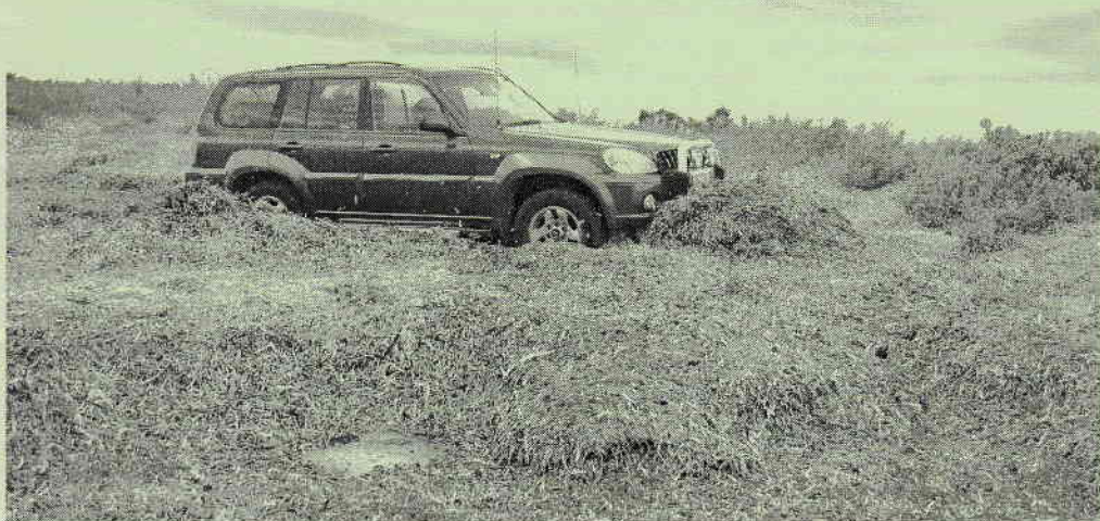
GRAHAM 'THE GRADER' AT MINLATON