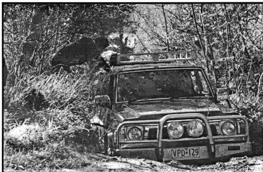
Mossiah in a bit of bother