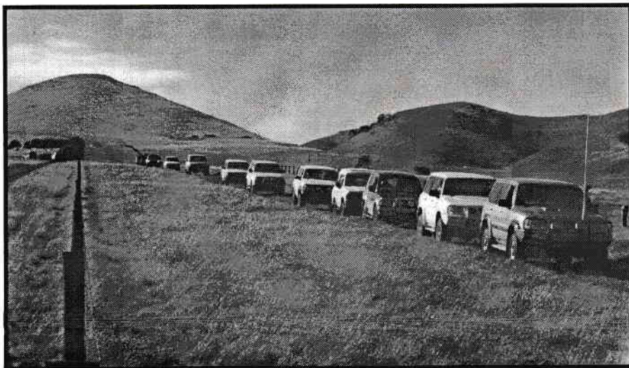
The procession at Deep Creek

Phone: (08) 8297-4477 Fax: (08) 8297-9989 email: need@camtech.net.au