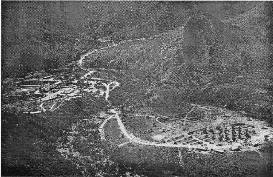
Aerial shot of Arkaroola

9a Anzac Highway, Keswick, South Australia, 5035 Phone: (08) 8297-4477 Fax: (08) 8297-9989 email: need@camtech.net.au