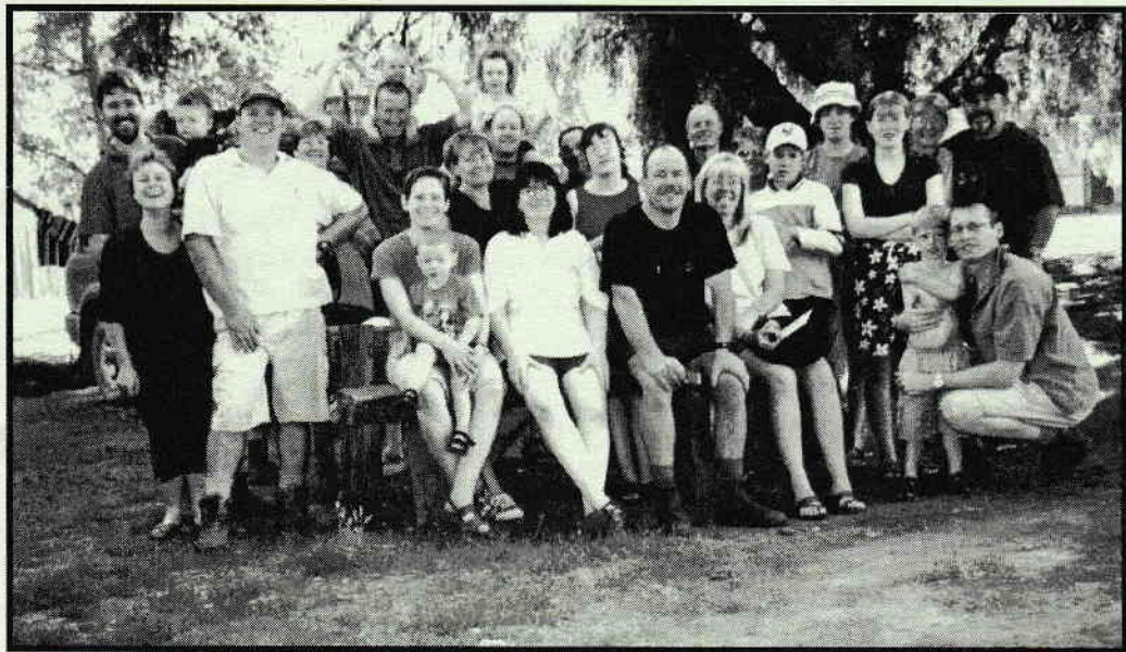
Group Shot of the Family High Country Participants—Licola