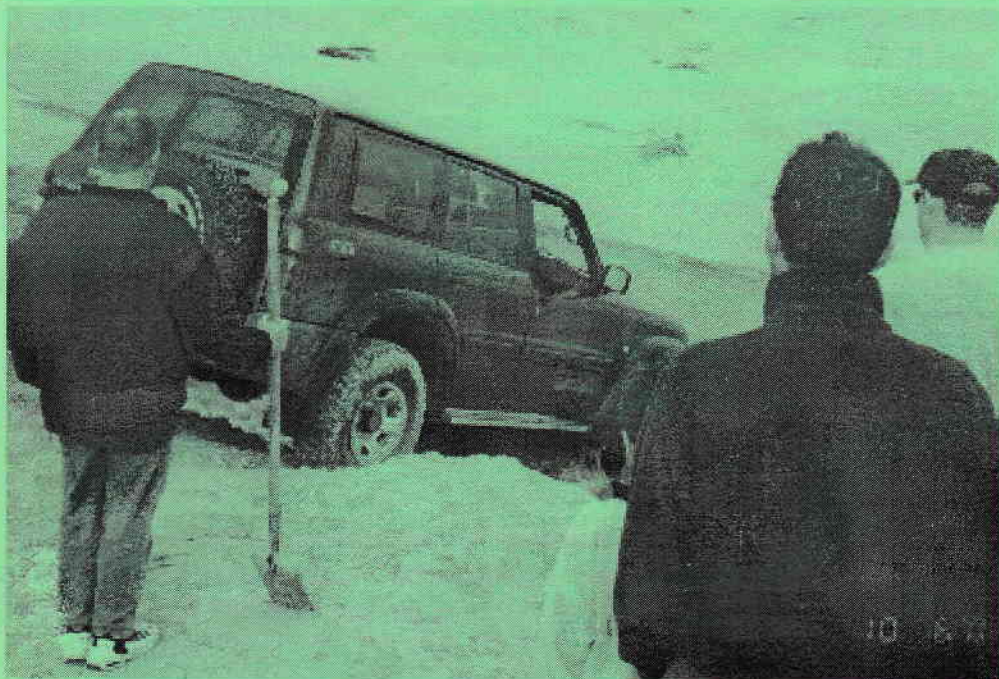
Experimenting with Beach descents