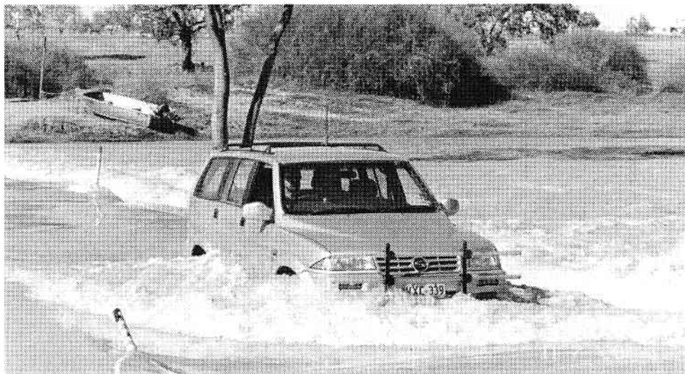
Rhino going across the Cooper

Please speak to Greg Goding for more details or to enrol.