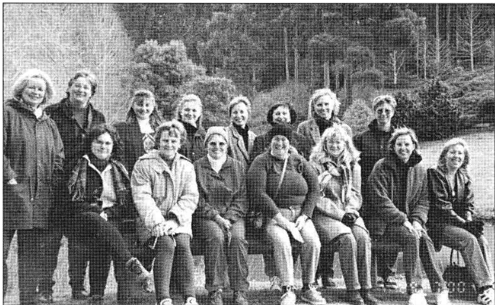
A group photograph of the Hahndorf Honey's