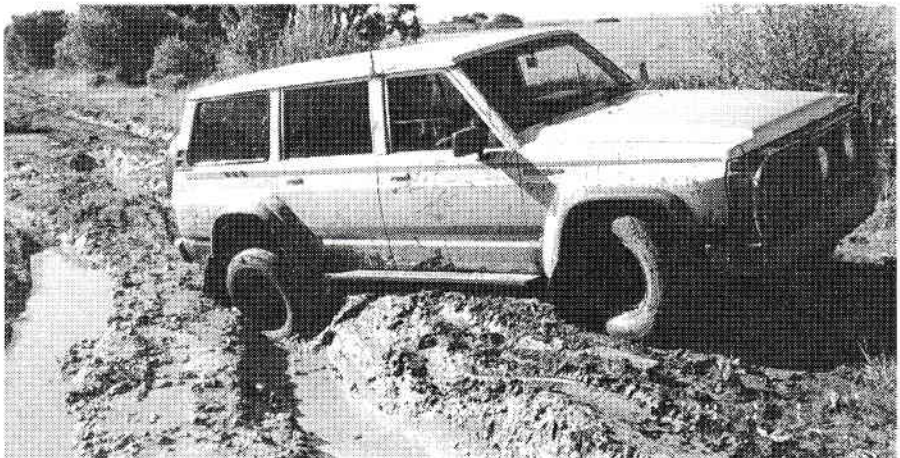
No Pizza Photo, so here's one of Casper Slipping off a track