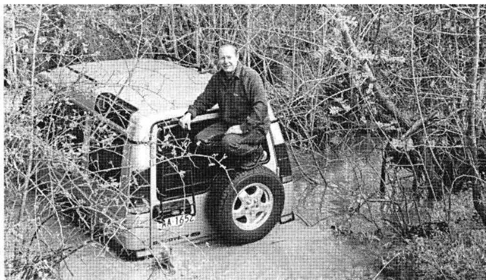
Our Vice Pres. Making sure the Disco sinks a bit further

Keep your 4WD in TOP condition. Alltrac 4WD can service your vehicle and stamp your service booklet to ensure warranty conditions are adhered to. Our service technicians work on 4WD vehicles every day and they are 4WD enthusiasts as well. This gives them the knowledge of knowing exactly what to look for when servicing your vehicle and the exceptional standard of workmanship required to ensure that you don't get let down when away on the beaten track. Remember, for 4WD service, repairs, and wheel alignment Alltrac 4WD are the experts. We have quality checking systems in place to ensure that the work performed on your vehicle is totally and independently double checked prior to release to you, so that you can head off to the outback with absolute confidence.