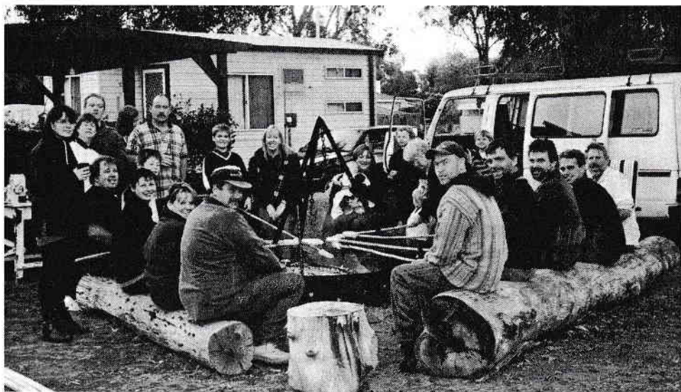
The group which attended the Minlaton Trip. May 2000. See report page 7

Alltrac 4WD 305 South Rd. Mile End 5031 ph (08) 8234 5299 a/h 018 846 544