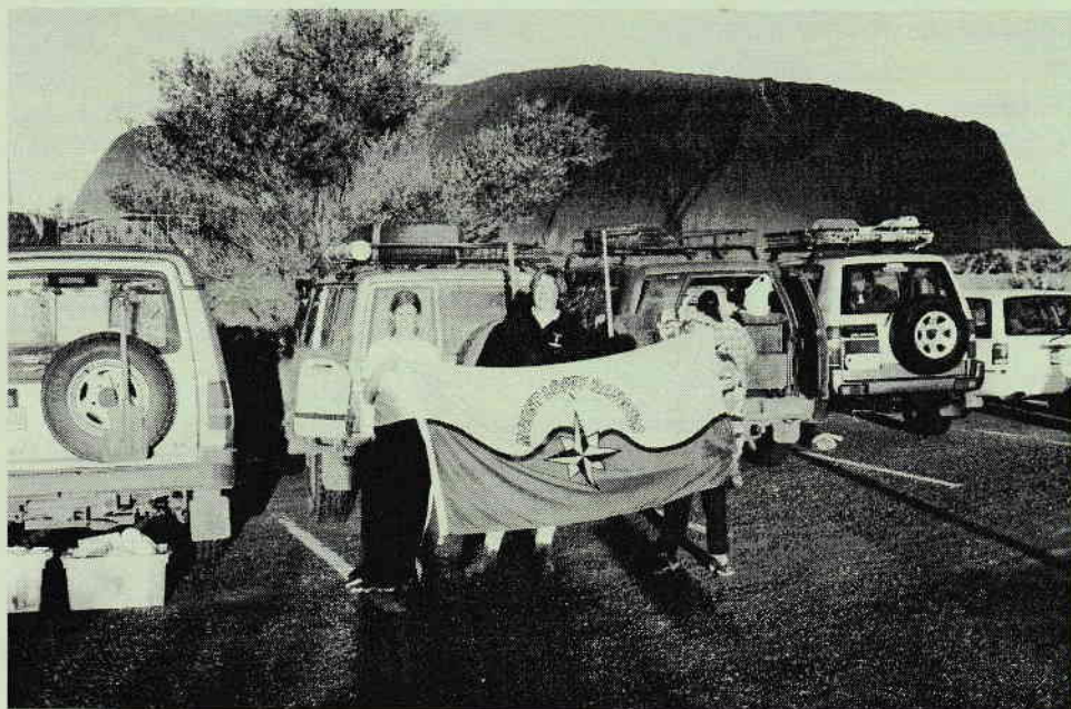
Flying the Banner at Ayers Rock – See Report Page 3