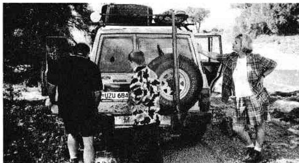
Who threw that stone?