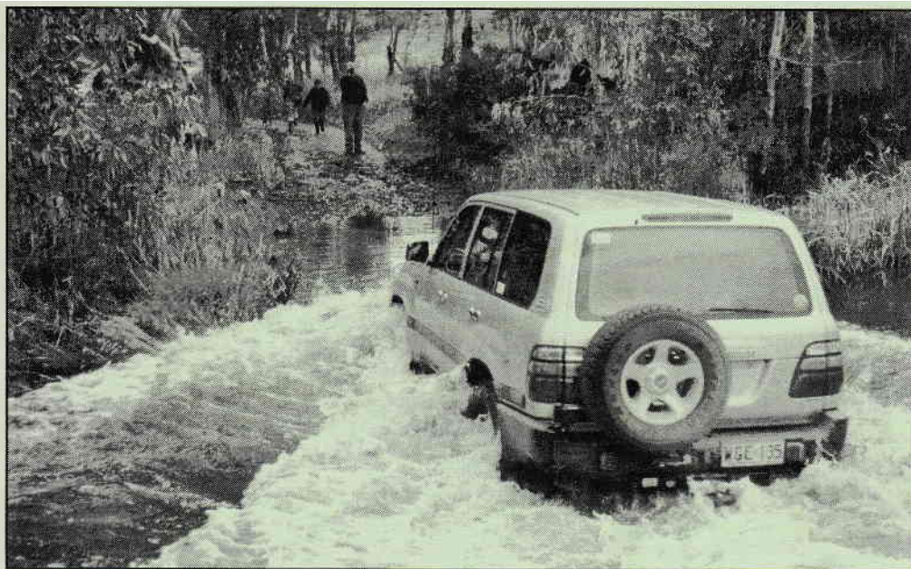
Doug Laird crossing the Finnis River – Kuitpo Trip (Report page 13)