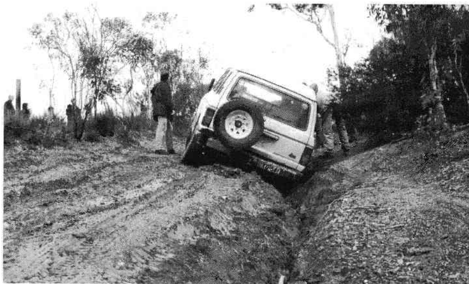
Murray Tucker stuck in a rut at Cox Scrub Track – Kuitpo Trip (See page 13)

Alltrac 4WD 305 South Rd. Mile End 5031 ph (08) 8234 5299 a/h 018 846 544