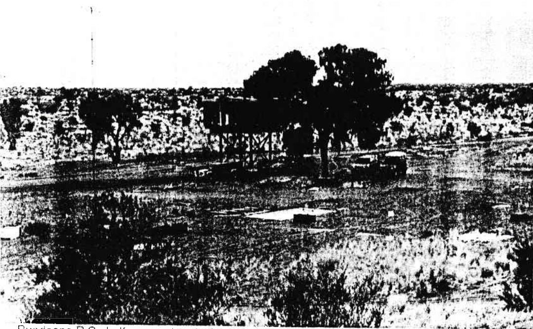
Bundoona R.S., halfway on the old Ghan rail line