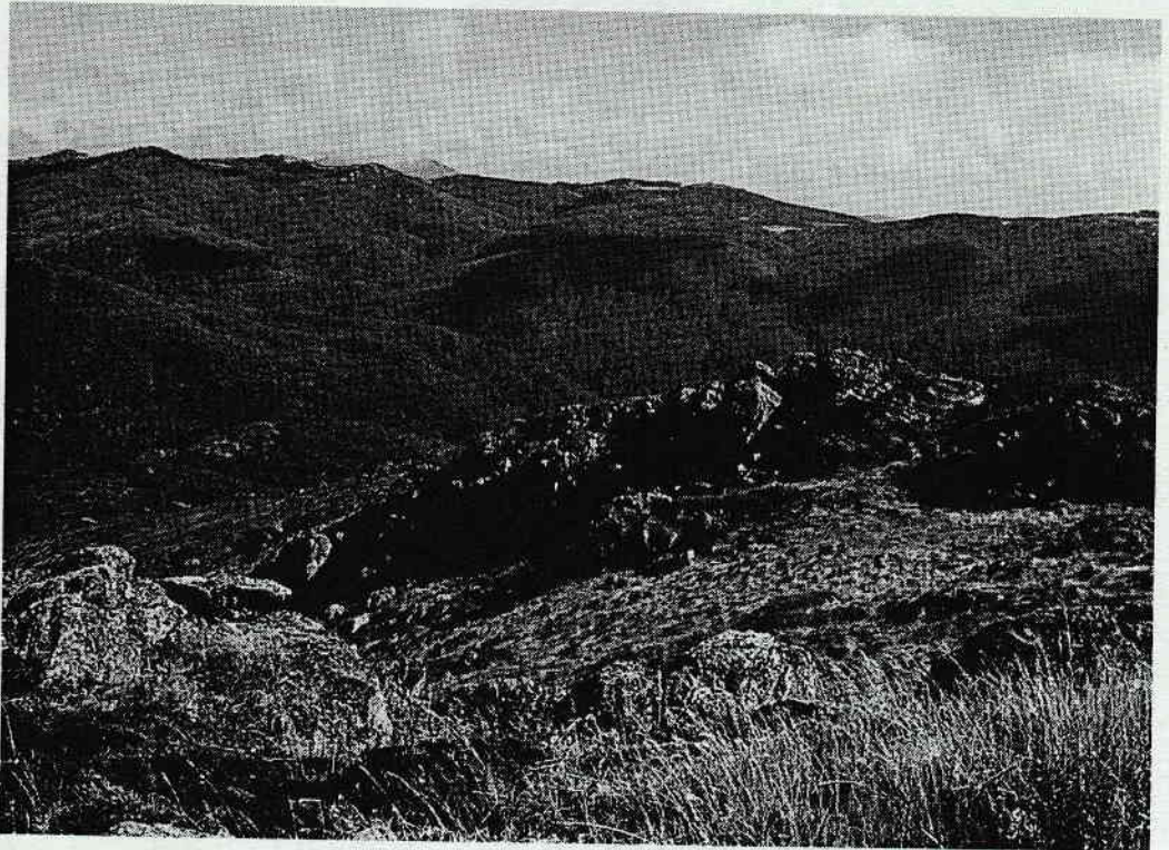
View of the Victorian Alps Read story inside