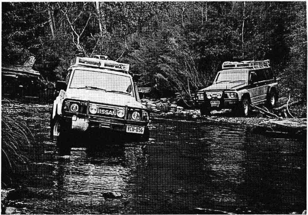
Crossing one of the many streams