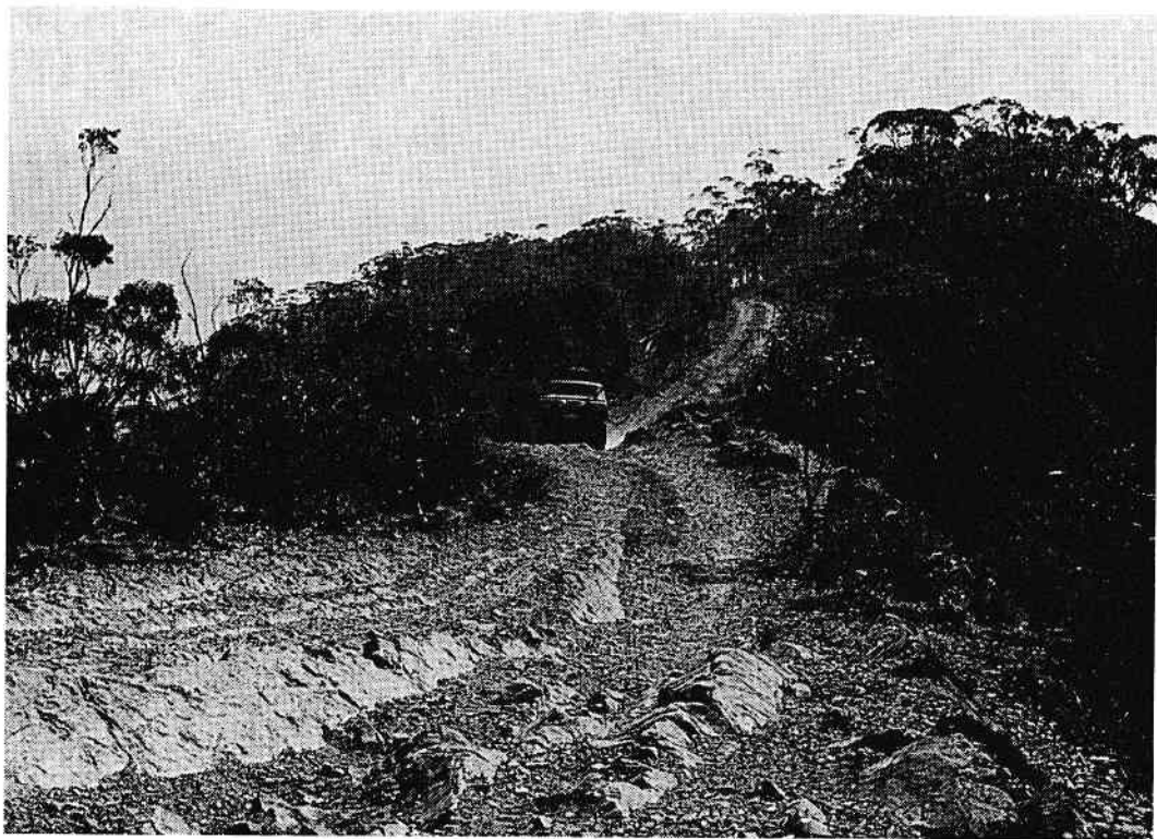
Ridge Tracks of the Alps