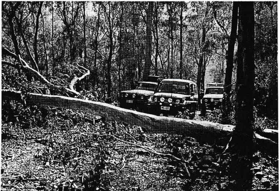
Out with the Chain Saw!