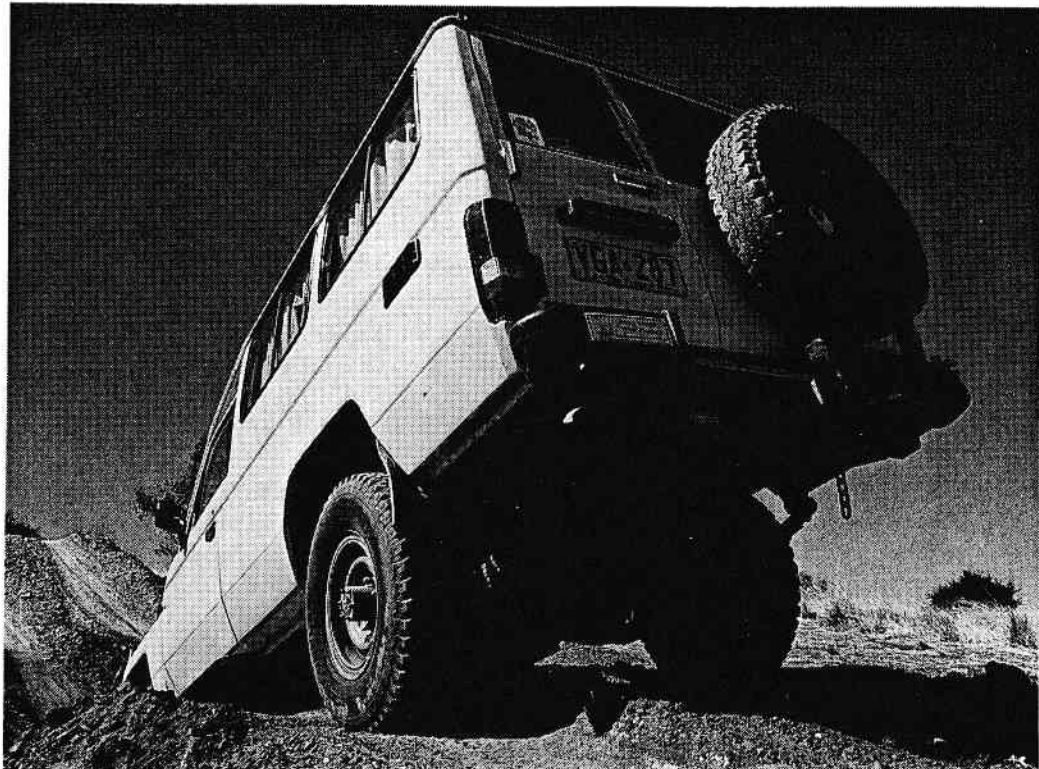
Nose down and bum up for this vehicle

A beautiful day for training or anything else. This event was so squeaky clean and new, we all had to wait until our trainer-teachers familiarised themselves with the course. Once we all got into the swing of things, it worked well - 6 trainers and 18 trainees. Apart from the recovery , key stall start, and mechanical areas where there was 1 trainer to 3 trainees, the other sections were dealt with on a one for one basis, and so if you said or did something dopey your trainer was there to put you on the right track.