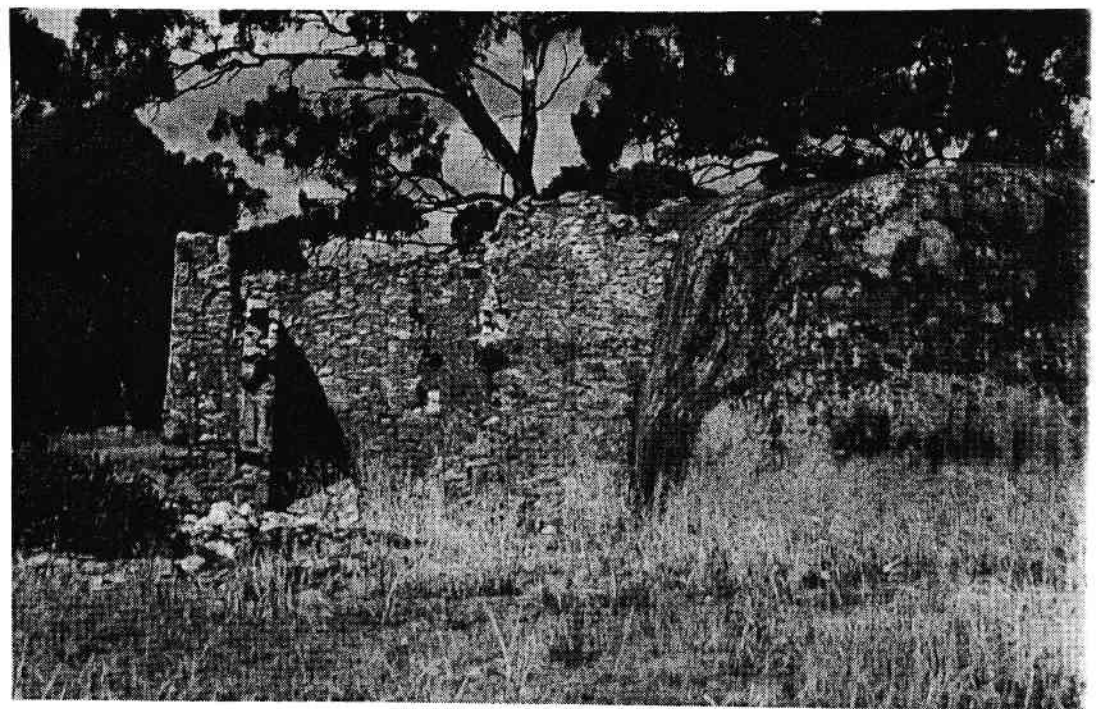
The Granite House